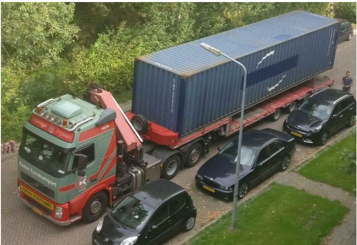
BIG CONTAINER: from Weesp (the Netherlands) to Fjågesund with necessary materials for Rwanda