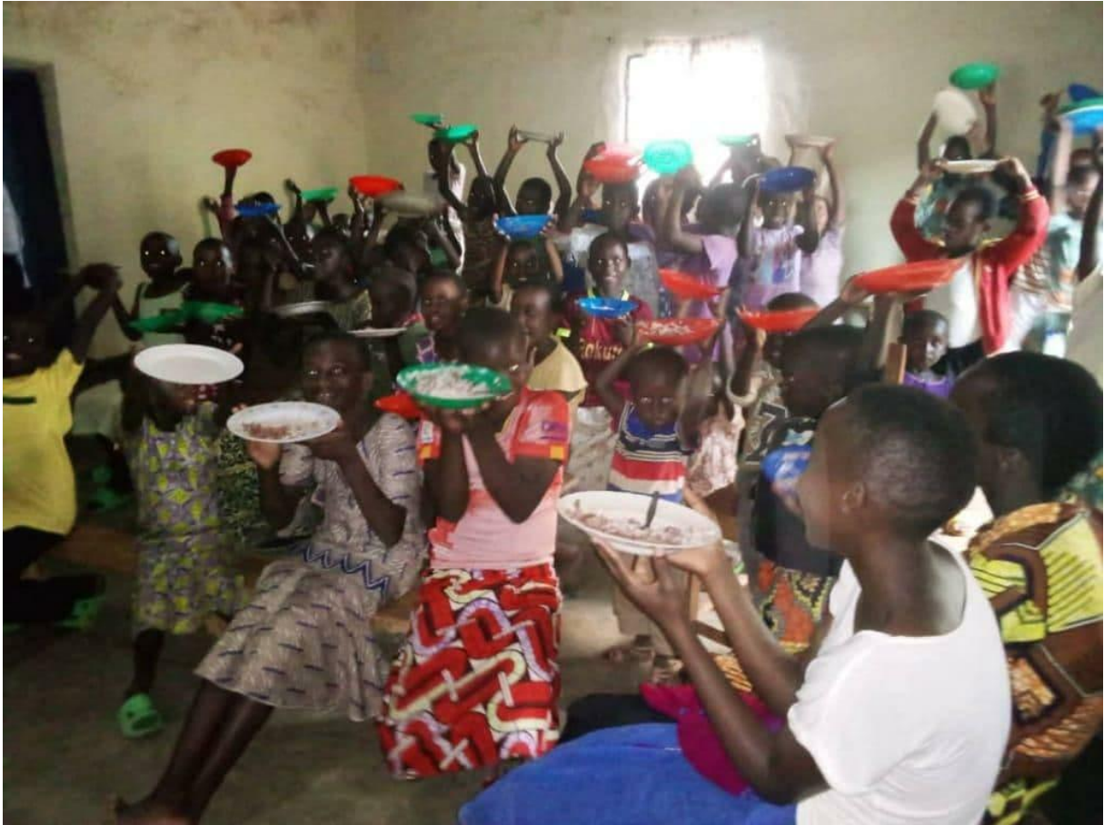
AGAPE Family in Rwanda: now 9.714 children are saved from the street and from hunger!!